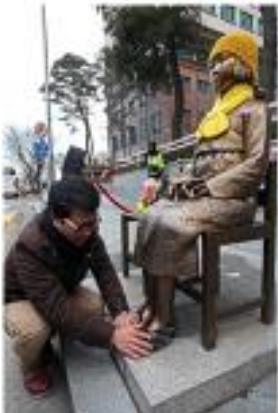
Pyeonghwa-bi: Peace Monument- Japanese Embassy in Seoul

in many different cities in Korea but also in other countries, and has become a symbol of the peace movement. More than 50 'girl's statues' have been erected already, as well as many plaques installed for peace, in different places around the world.