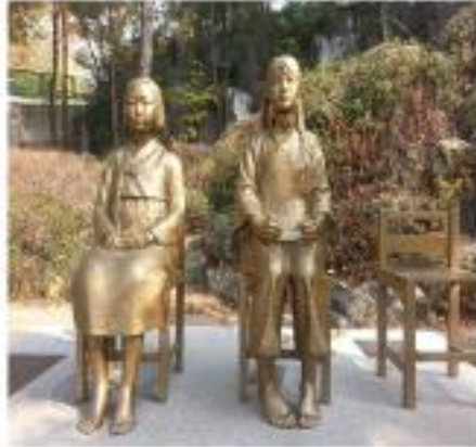
Korean and Chinese 'comfort women' statues, Seongbuk-dong, Seoul