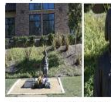
Central Park, Glendale, California